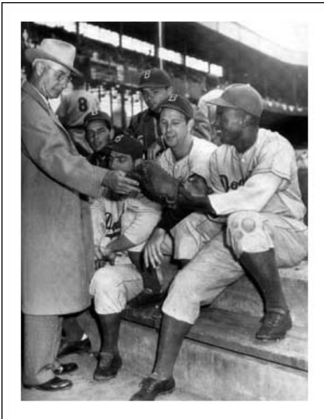
Baseball teams throughout the league celebrated the 60th anniversary of Jackie Robinson breaking the color barrier on April 15, 1947, by wearing No. 42 on their uniforms.