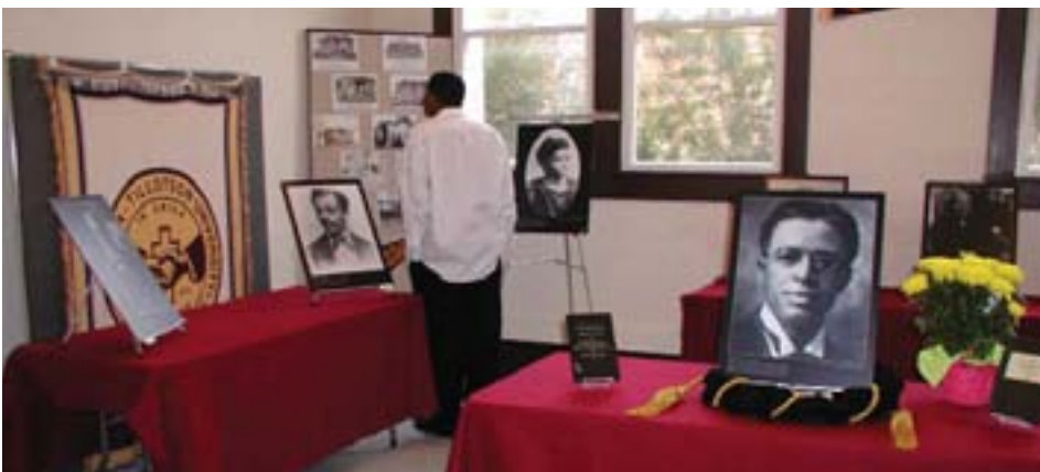
The "13 Black Classicists" traveling exhibit transformed the Bertha Sadler Means African American Heritage Resource Center into an historical journey.