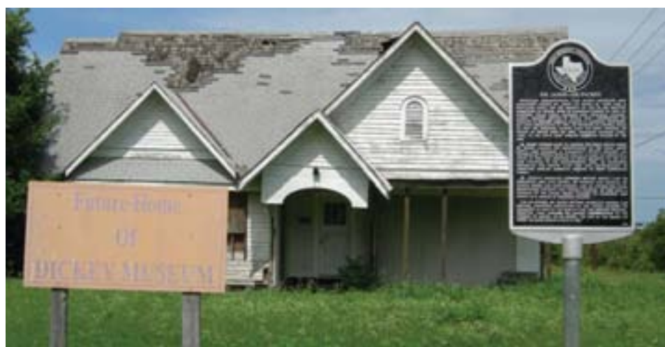
The James Lee Dickey historical marker was unveiled and dedicated on June 16, 2007, Juneteenth, at the future site of the Dickey Museum, 500 Burkett, Taylor, Texas. A celebration at the Fannie Robinson Park followed the ceremony.

CONTINUED... See Dickey Legacy , page 38