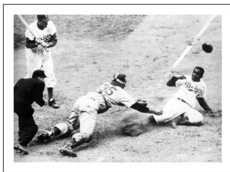
Jackie Robinson played his entire baseball career with the Brooklyn Dodgers. He hit 137 homeruns during his nine year career.

those road stretches, Robinson noticed a letter in his pile of mail from the Kansas City Monarchs. He couldn't turn down the opportunity to play for the most successful baseball team in the Negro league. His stay at Samuel Huston and in Austin was over. In 1945 he integrated major league baseball-broke the color line-when he signed with the Brooklyn Dodgers by way of their farm team, the Montreal Royals. He endured racial comments, bigotry, death threats, and physical harm while earning Rookie of the Year honors in 1947 for the national league, major league records, and capturing six World Series titles. Most importantly, he paved the way for other African American players in the minors and majors. ▶