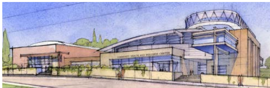
A rendering of the proposed Sandra Joy Anderson Community Health and Wellness Center.

To further the synergy of this initiative, Huston-Tillotson University has partnered with Austin Travis County Integral Care (ATCIC), Austin/Travis County Health and Human Services (HHSD), a Federally Qualified Health Clinic (FQHC), and other key stakeholders to provide mental- and behavioral-health practitioners committed to servicing a diverse population that has been absent of minority caregivers and service providers. In addition, the City of Austin is providing support and has endorsed the initiative.