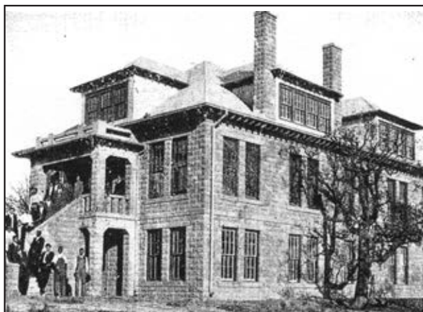
Top: Reflecting the historic beauty of Huston-Tillotson's campus: the Anthony and Louise Viera-Alumni Hall; and bottom left, a historic photo of Evans Industrial Hall in 1911, and above; along with the restored hall today.