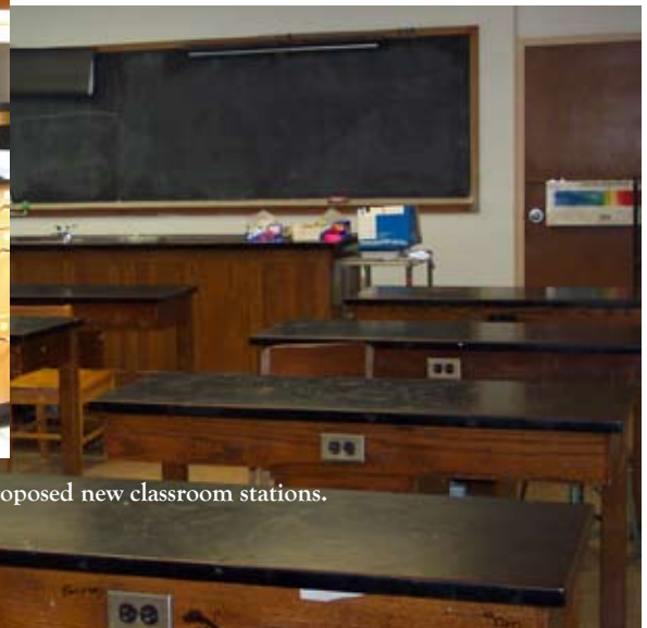
Inset shows proposed new classroom stations.