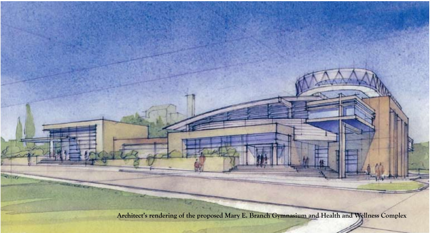
Architect's rendering of the proposed Mary E. Branch Gymnasium and Health and Wellness Complex

The efforts behind Homecoming 2009 resulted in a record number of alumni returning to the campus, and, in particular, to the ever-popular basketball game in the Mary E. Branch gymnasium. Additional bleachers on the stage were not enough for the capacity crowd in the unair-conditioned facility. The gymnasium will not only increase enrollment at the University by providing a modern, attractive facility for athletes, but it will solve the University's venue dilemma for popular events like homecoming and commencement. In addition, programs and concerts that are simply too problematic to schedule on campus now, would be ideal for the new complex and would bring additional revenue to the institution.