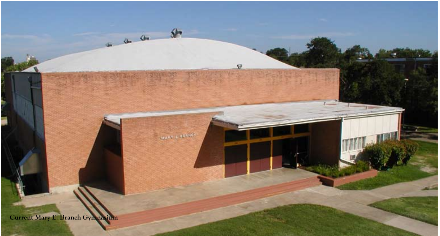
Current Mary E. Branch Gymnasium

Imagine a corner of what was once “bluebonnet hill” transformed into a complex that becomes the envy of the community not only for its architectural design but for the services and programs housed within. Further imagine, the existing Mary E. Branch Gymnasium redesigned into a state-of-the art facility that will serve the needs of the campus and beyond. A modern building, the first since the chapel/humanities building was constructed in 1974, will be constructed on the Huston-Tillotson campus. Approximately 150,000 square feet with a 300-space parking facility, the health and wellness complex will act as a catalyst that will transform the state of health care access and bring together the HT departments of kinesiology and intercollegiate athletes.